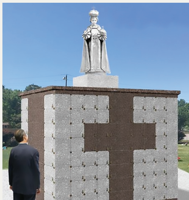
Art rendering of the Infant of Prague from Calvary Cemetery's Holy Innocents section.